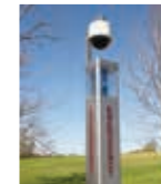
EMERGENCY PHONE SYSTEMS